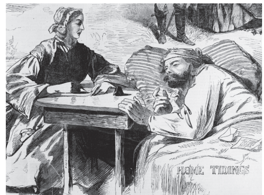
“Our Women and the War” Illustration by Winslow Homer. From Harper’s Weekly , September 6, 1862

In December 1864, with the Civil War rushing toward its denouement at Appomattox Court House, Mark Twain published what was to become one of his most popular Civil War stories: “Lucretia Smith’s Soldier.” The narrator declares this a response to those “sickly war stories in Harper’s Weekly ,” stories steeped in sentimentality, usually depicting hospital scenes rather than battle scenes. Having grown up in the border state of Missouri, Twain rebelled against the easy resolution of dilemmas seen in these “sickly war stories. Just as he would later blame Sir Walter Scott’s romantic fiction for causing the Civil War, in “Lucretia Smith’s Soldier,” Twain suggested that our tolerance for war was related to a romantic and sentimental writing. Reading those original Harper’s Weekly stories alongside Twain reveals his early rejection of romantic fiction as an aesthetic but also the antiwar sentiments visible throughout his career. Stories like “Lucretia Smith’s Soldier” show that Mark Twain was indeed sick of war stories, for he viewed them as contributing to our tolerance for war in the first place.