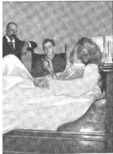
MARK TWAIN TALKING TO REPORTERS IN BED

ce with this stone and the and that the shaver could, nywhere. ; rubbed it on his unshaven onder at the result; then remarked with a quiet, sort the Madam (he generally the Madam') will have no my never being ready for ) long to shave. I will just Sunday. Then when I get hing out and enjoy a quiet ng prayer."