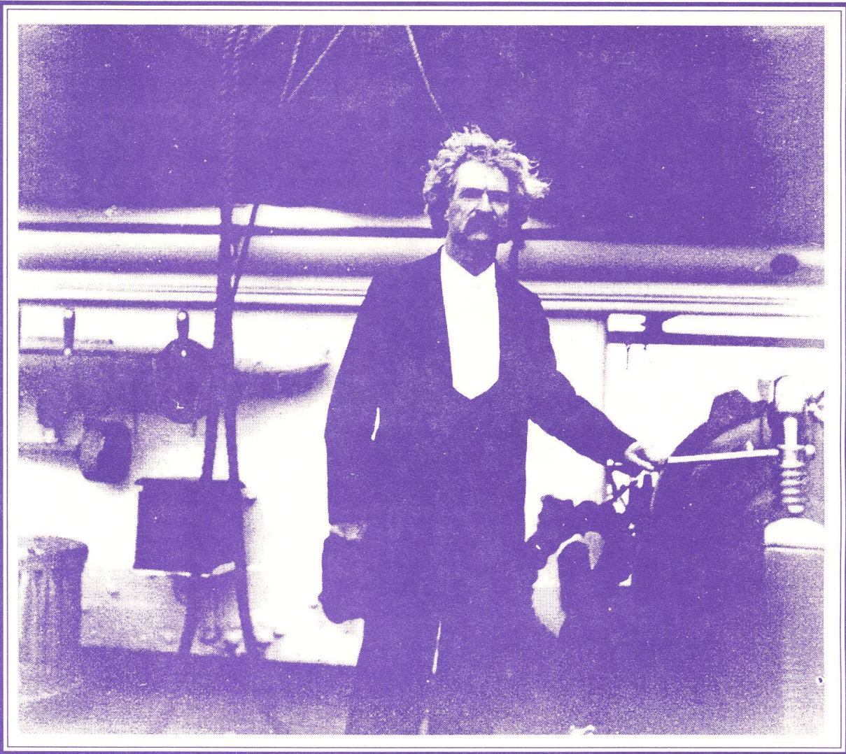
Mark Twain Aboard the U.S.S. Mohican, August 13, 1895.

Celebrating the centennial of Following the Equator