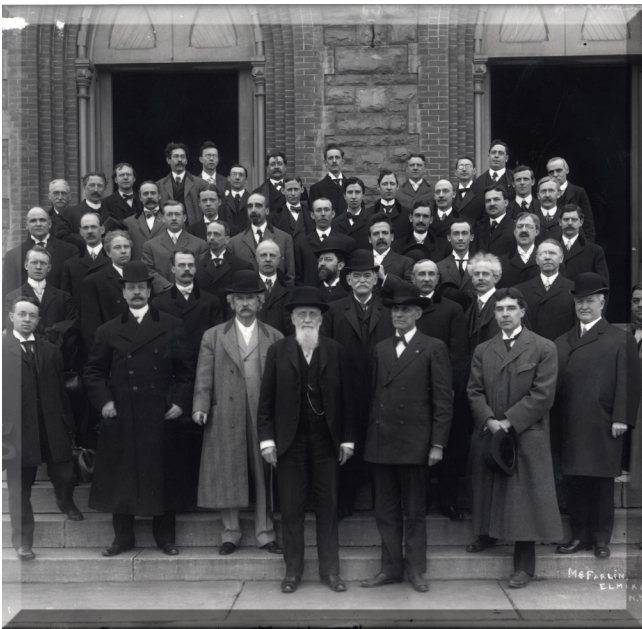
Mark Twain (left of center with a light-colored coat) in front of The Park Church.