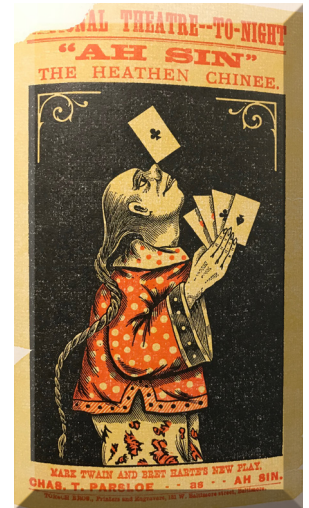
Playbill for the Washington, D.C. run of Ah Sin at the National Theatre, May 1877