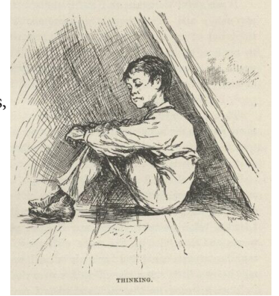
Image from Chapter 31 of the first edition (1885) of Adventures of Huckleberry Finn