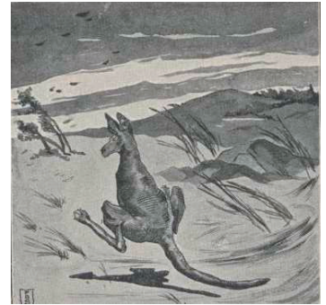
From Following the Equator