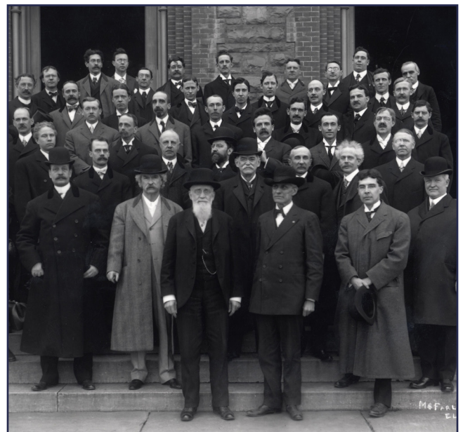
Mark Twain (left of center with a light-colored coat) in front of The Park Church.

Founded in 1846 by a group of abolitionists, The Park Church has been a strong presence in Elmira’s history and some of its congregation were close friends and family members to Mark Twain. Known for its striking architectural features, The Park Church contained Elmira’s first public library and has a long history of charitable service to the Elmira community. Currently, it is a United Church of Christ open and affirming congregation, welcoming all people to worship and participate in its communal life, regardless of ethnic origin, race, class, age, ability, gender, or sexual orientation.