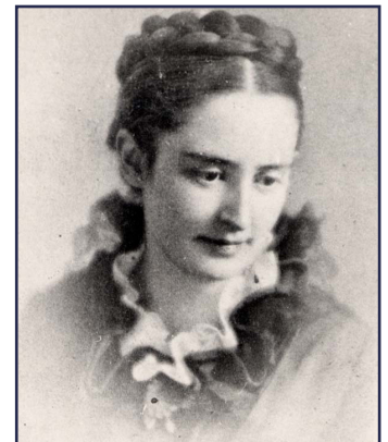
Olivia Langdon Clemens

The letters of Olivia Langdon Clemens reveal her deep emotion as well as the more ordinary impulses of her thought. In communications with friends and family, and with her world-famous spouse, Olivia exposes her intelligence, fortitude, gentleness, kindness, humor, love for husband and children—along with her anxieties, self-deprecation, and flaws. Possibly the following statement, written to her husband during their plunge towards bankruptcy, best indicates her world view: “I feel so strongly these days that we have not a great while to stay here and that there is only one thing of real importance to us. To do all the good that we can and leave an irreproachable name behind us” (9 April 1893). The presentation will summarize critical views of Olivia as well as highlight selections from her letters.