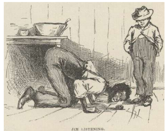
Illustration from the first edition of Adventures of Huckleberry Finn by Edward Windsor Kemble

In Following the Equator (1897), Mark Twain wrote, “Let me make the superstitions of a nation and I care not who makes its laws or its songs either.” Yet, despite this indication that Twain viewed superstition as a supremely powerful social force, scholars have had surprisingly little to say about the role of superstition in Twain’s most famous novel. From Jim’s fortune-telling hair ball to Tom Sawyer’s “witch pie,” magic and folklore are much more than mere manifestations of “local color” and minstrel show humor in Adventures of Huckleberry Finn . Conjuring is Twain’s metaphor for the twin powers of memory and prediction that are at the heart of the novel’s critique of post-Reconstruction America. In Huckleberry Finn , conjure becomes a metaphor for two competing ways of reading: Jim’s fortune-telling and Huck’s transformative retrospection.