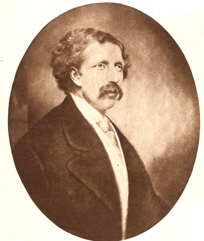
Artemus Ward, from a photo owned by the Lotos Club, New York