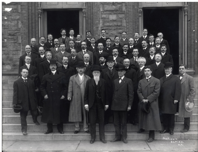
Mark Twain (left of center with a light-colored coat) in front of The Park Church.