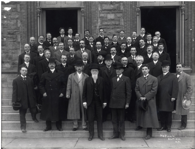
Mark Twain (left of center with a light-colored coat) in front of The Park Church.